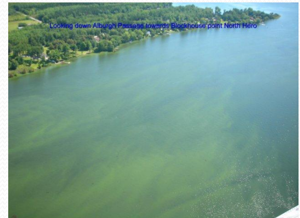
Larry DuPont, 2008